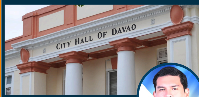
DAVAO CITY MAYOR SEBASTIAN Z. DUTERTE