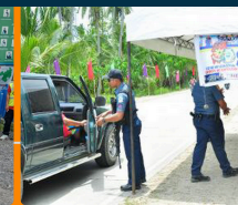
Safety and Security regulatory functions of big events in the City